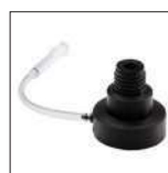
A00000135 Sensor check