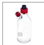
A00000410 Denitrification glass bottle