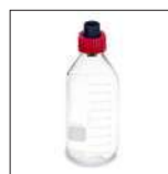
A00000419 Kit plastic biodegradability analysis