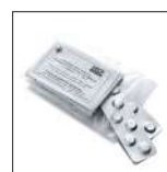
A00000136 Control Test tablets