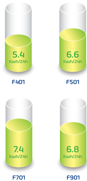
Fig 4: Energy Consumption values of the Plasma Storage Freezers from B Medical Systems (230V / 50Hz Models)

The energy consumption values of B Medical Systems' Plasma Storage Freezers are shown in Fig 4.