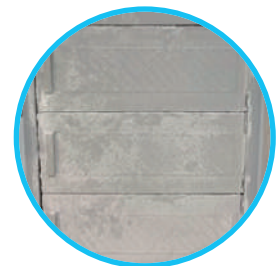
Fig 1: Ice formation in Freezers