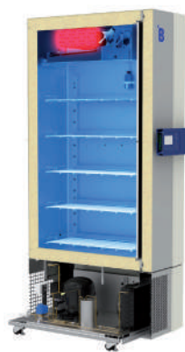
Fig 3: Airflow Ventilation of Plasma Storage Freezers from B Medical Systems with evaporator on top

Defrost the unit based on a pre-set time and/or the presence of moisture. The system detects the usage pattern of the freezer based on door openings, which is the major source of moisture intake to the freezer. The smart auto defrost technology can perform 0-4 defrost cycles per day enabling frost-free operation. The auto defrost parameters are pre-programmed but can be adapted upon end-user request to better fit their usage needs.