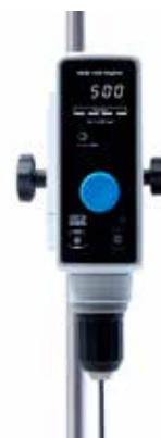
OHS 100 Digital