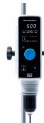
OHS 200 Digital