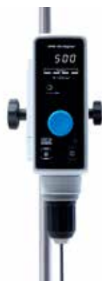
OHS 60 Digital