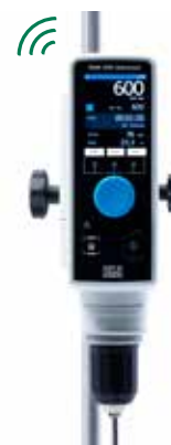
OHS 200 Advance Pt 100 included