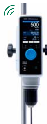
OHS 100 Advance Pt 100 included