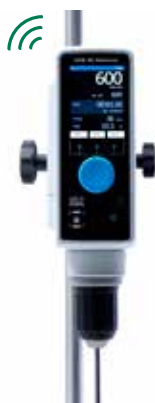
OHS 60 Advance Pt 100 included