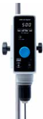
OHS 20 Digital